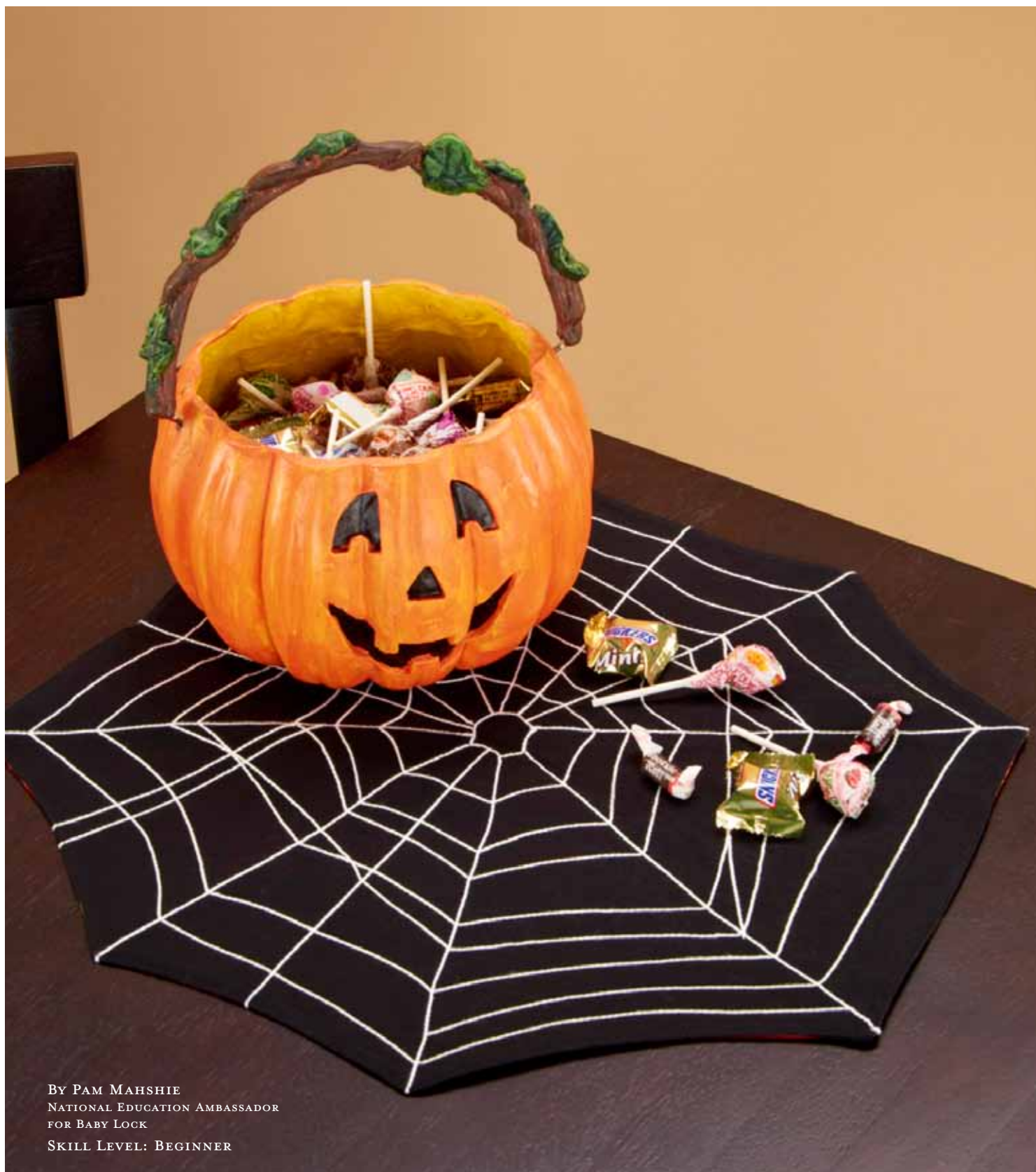
BY PAM MAHSHIE NATIONAL EDUCATION AMBASSADOR FOR BABY LOCK SKILL LEVEL: BEGINNER