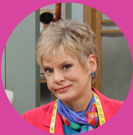
Nancy Zieman Host of PBS Show Sewing With Nancy

When I have an idea for a project and it calls for embroidery, the right tools make all the difference. The new Valiant is certainly the tool for the job with built-in features like a digital camera, NeedleCam™, which gives you a zoomed in view to aid in perfectly placing that design.