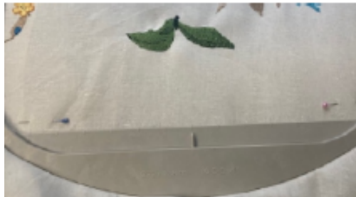
Note the pins securing stabilizer.